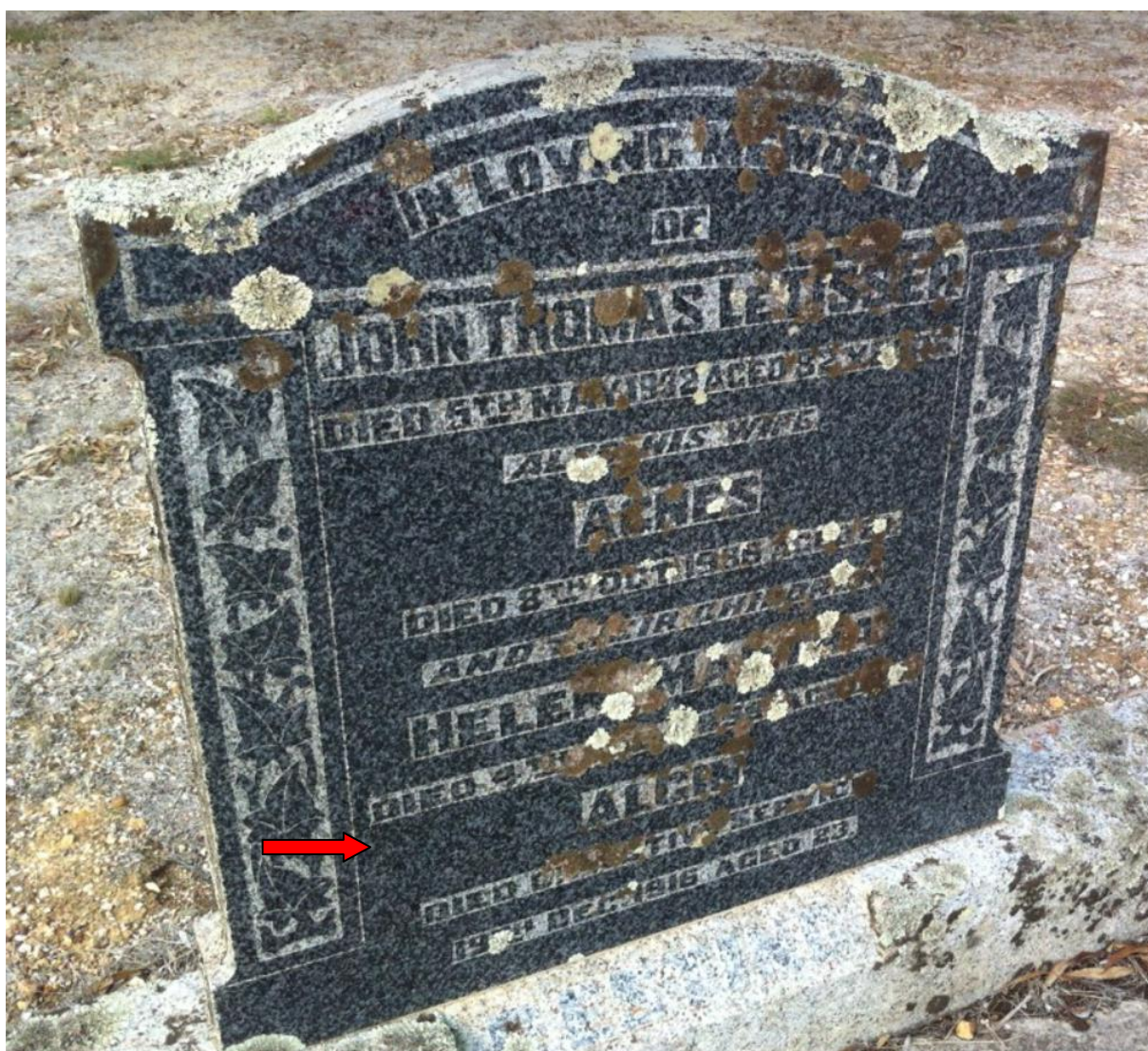
Le Tisser Headstone