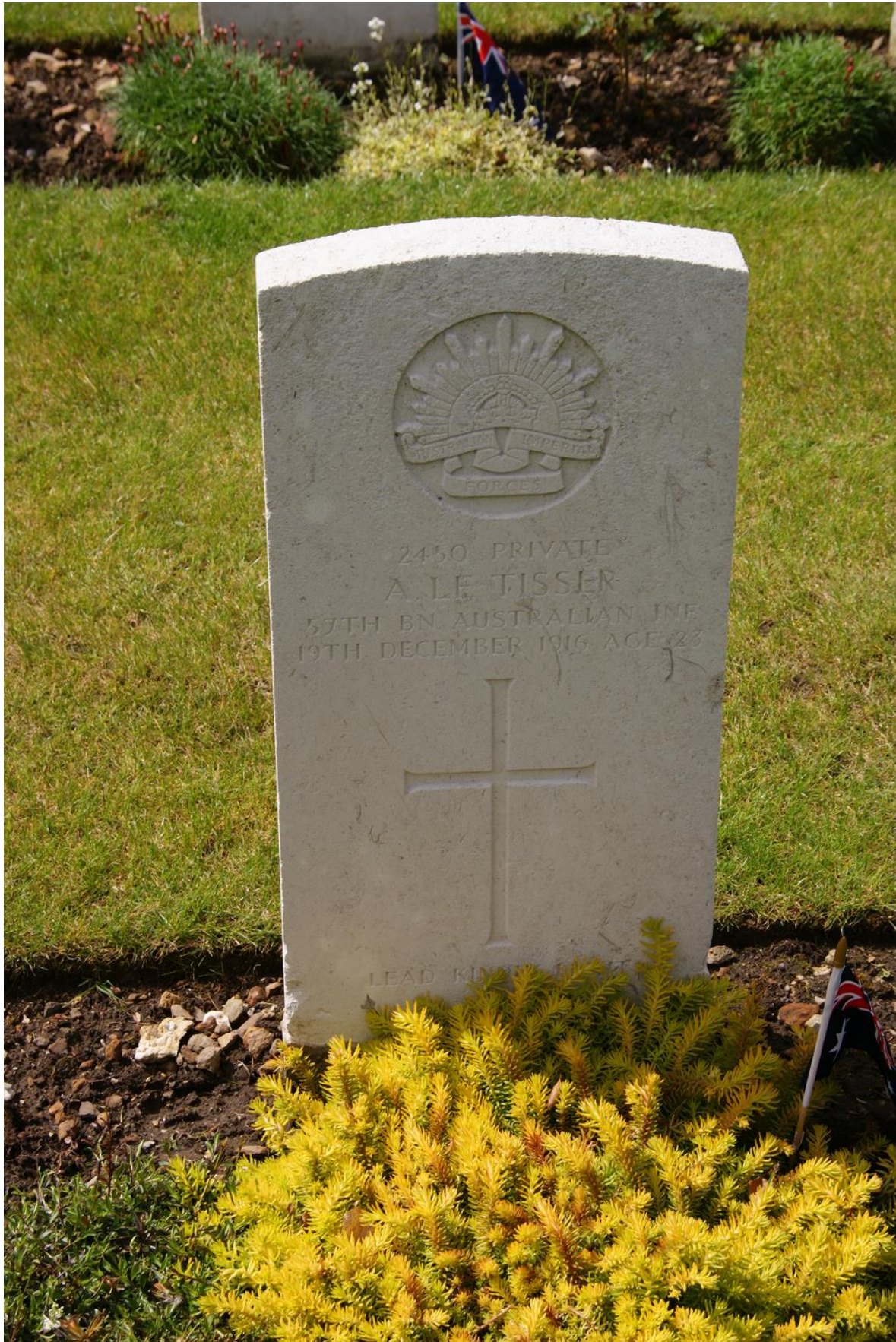
Photo of Pte A. Le Tisser's Commonwealth War Graves Commission Headstone in Compton Chamberlayne War Graves Cemetery, Wiltshire, England.