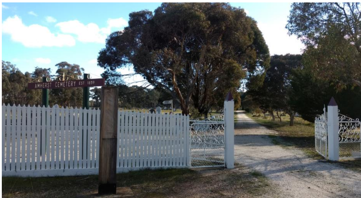
Amherst Cemetery