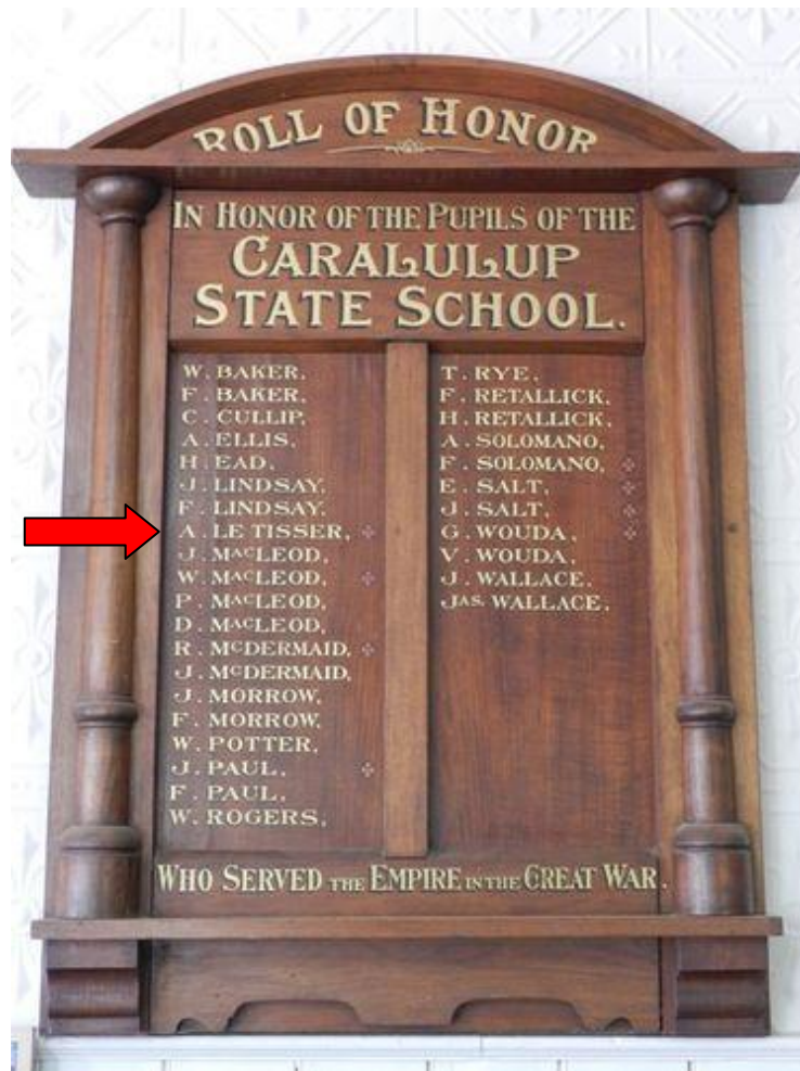
Caralulup State School Honour Roll