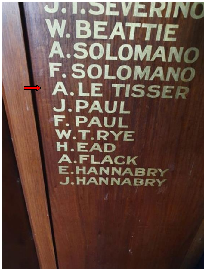
Evansford Honor Roll